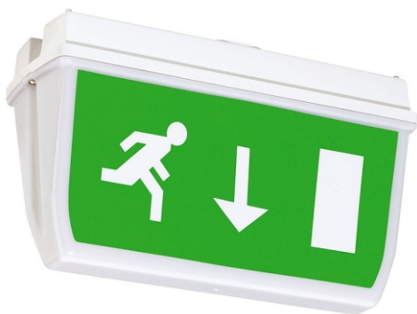
Optional: trapezium shape diffuser

- Optional: DALI digital self test in accordance with BSEN62034.